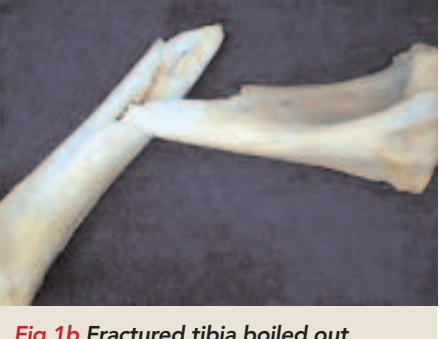
Fig 1b Fractured tibia boiled out