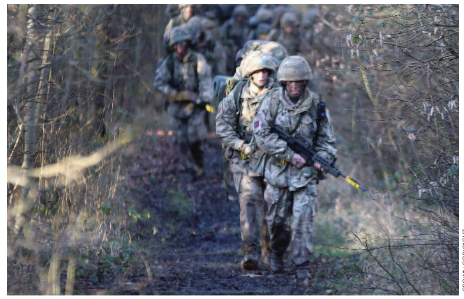
Racehorses and soldiers are similarly at risk from stress fractures induced by training

Stress fracture lies at the far end of a continuum of bone response to stress. It starts with bone strain which is subclinical yet detectable on bone scan, and passes through stress reaction which is focally tender and more obvious on bone scan, then progresses to stress fracture once a line is distinguishable on diagnostic imaging. Of course fractures can result from a one-off accident involving momentary overload from extraordinarily high forces such as a kick, collision or fall, but such "monotonic" fractures are less common.